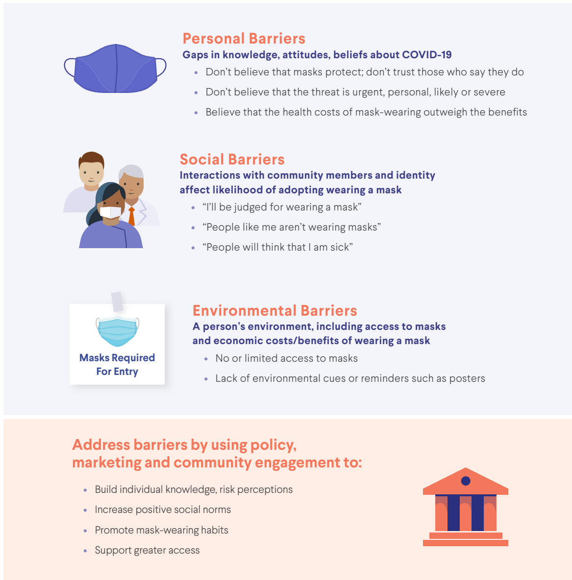
Figure 2: Why don't people wear masks?

may be used to change knowledge, attitudes and practices and influence perceived social norms around mask-wearing, addressing some of these barriers. It's important to periodically conduct barrier analysis to understand why people aren't wearing masks. This can help target messaging and identify trusted sources of information for the audience