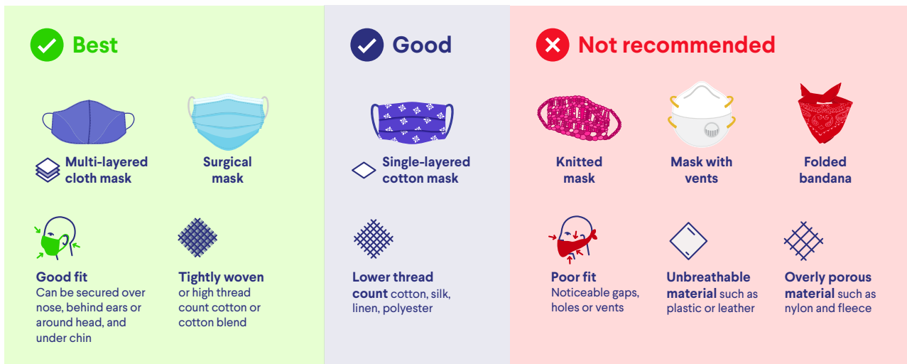
Figure I. What to look for in a mask